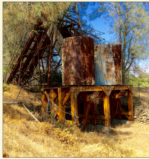
Looking north toward the restored support beams under the ore hoppers on the mine.