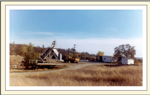
Photograph of the main shaft of the Dannebrouge in the 1950's, showing outbuildings and the new "A" frame.